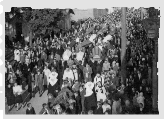
Burial of the victims of the train raid near Zatyle

Genocide is a legal category. The Volhynian massacres have all the traits of genocide listed in the 1948 UN Convention on the Prevention and Punishment of the Crime of Genocide, which defines genocide as an act "committed with intent to destroy, in whole or in part, a national, ethnical, racial or religious group, as such." In Polish academia the Volhynian massacres are referred to as genocidal ethnic cleansings, the Volhynian (or Volhynian-Galician) slaughter, or, in legal terminology, the crime of genocide. Regardless of which qualification of the Volhynian massacres is the most suitable, there is