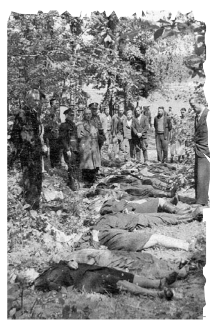
Victims of the train raid near Zatyle (near Lubycza Królewska) executed on 16 June 1944 by UPA.

Poles had to abandon their homes and seek shelter in the cities and towns which had posts of Hungarian and German troops. It was an irony that in order to escape from the UPA Poles had to seek protection from their oppressors: firstly from the Germans, and during 1944-1945 from the Soviets. The Germans deported Polish escapees to the Reich to forced labor. To escape the massacres some escapees tried to get to the General Government, particularly to the Lublin District. Finally, a small number of Poles created self-defence centers to protect themselves, with the most well-known ones located in Przebraże (where 10,000 Poles defended themselves), Huta Stepańska (600 Poles dead), Zasmyki, Dederkały, and Ostróg. Due to the lack of arms, ammunition, and a cadre of commanders most of the approx. 100 Polish self-defence centers were defeated.